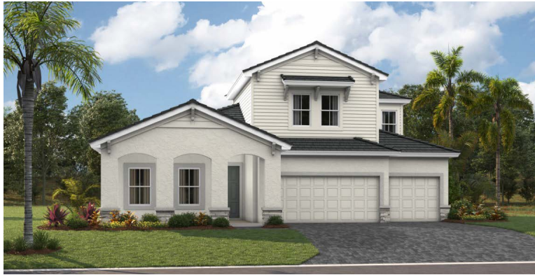
COASTAL A | COA5