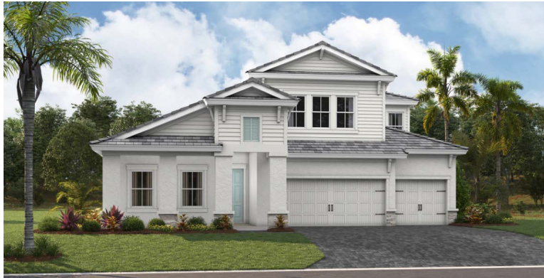
COASTAL B | COA2