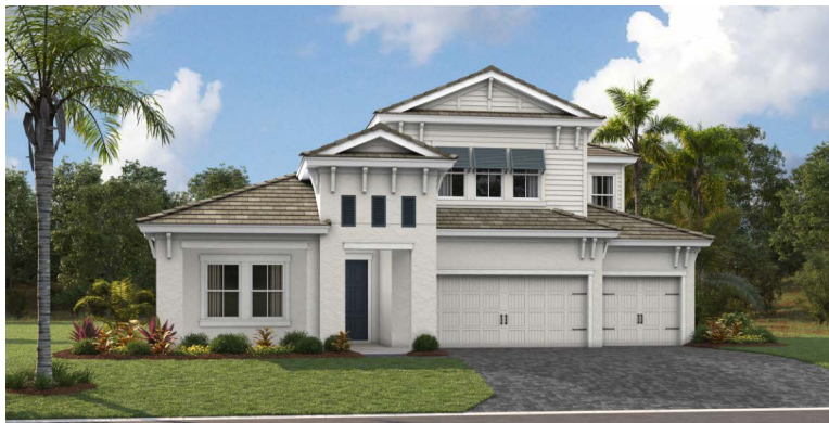
COASTAL C | COA1