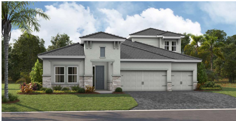
COASTAL B | COA4