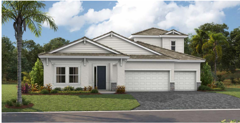
COASTAL A | COA1