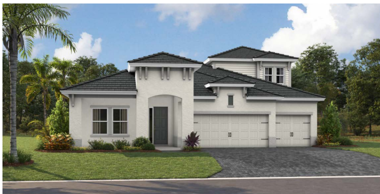
COASTAL C | COA5