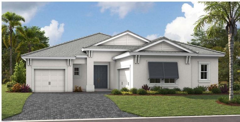
COASTAL C | COA10