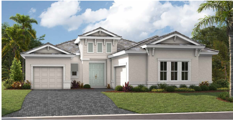
COASTAL A | COA6