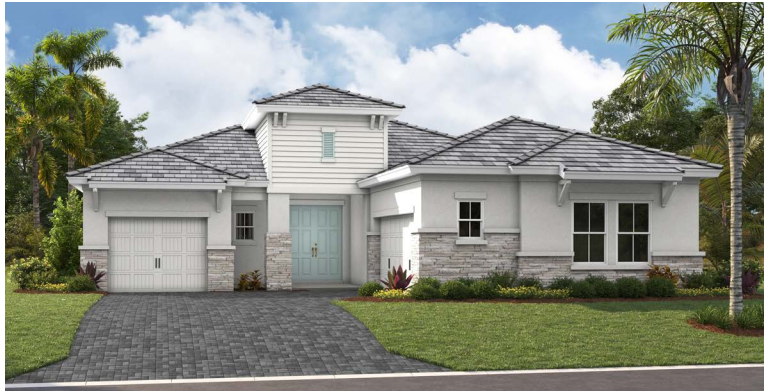
COASTAL B | COA2