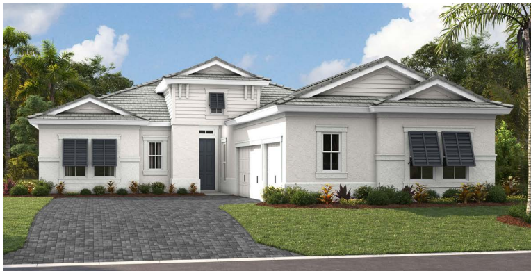
COASTAL C | COA10