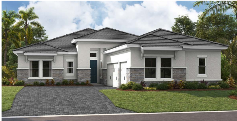
COASTAL B | COA7