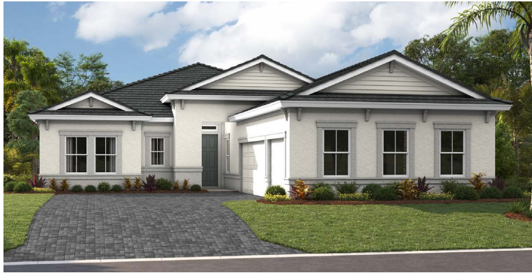
COASTAL A | COA5