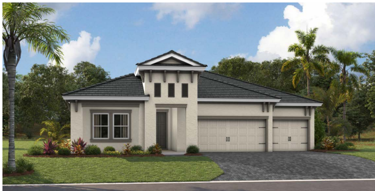
COASTAL C | COA12