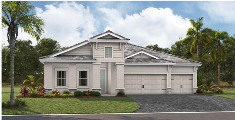
COASTAL B | COA6