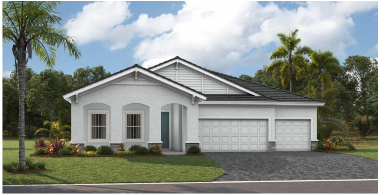
COASTAL A | COA8