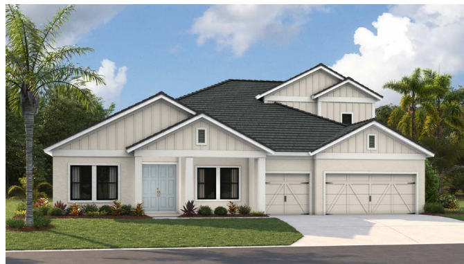
Modern Farmhouse | MFH4