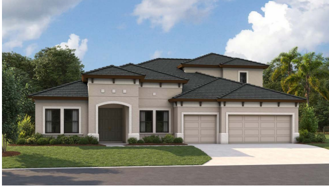
Mediterranean A | FMA6

4,801-4,812 Square Feet 5-6 Bedrooms | 4-5 Baths 3-Car Garage