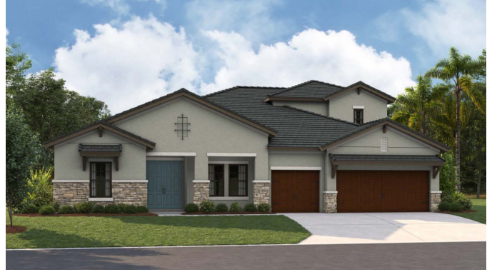
Tuscan A | TUS9