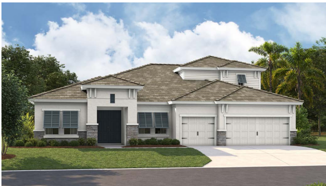
Coastal C | COA1