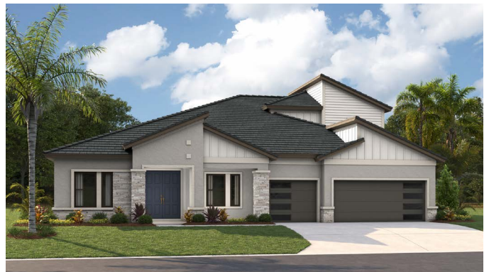
Modern | MOD2