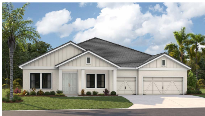
Modern Farmhouse | MFH1