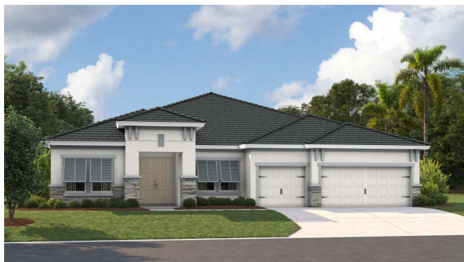
Coastal C | COA3