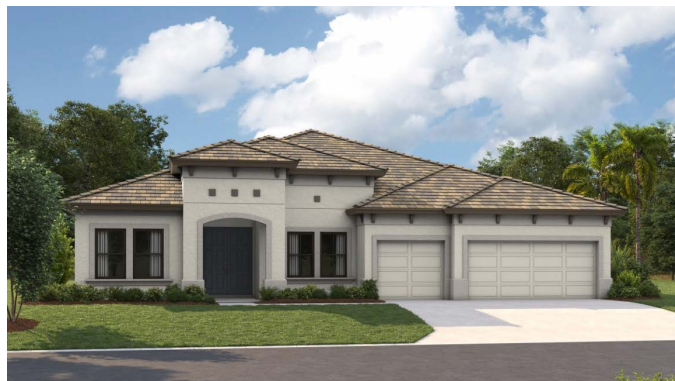
Mediterranean A | FMA14