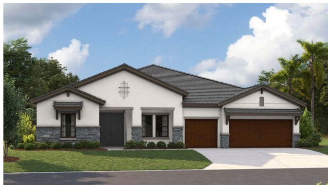
Tuscan A | TUS7