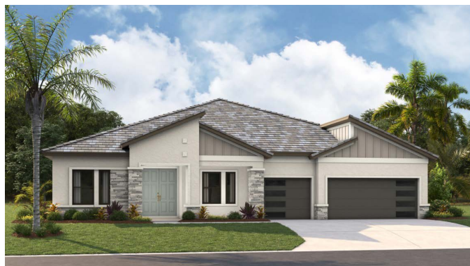
Modern | MOD6