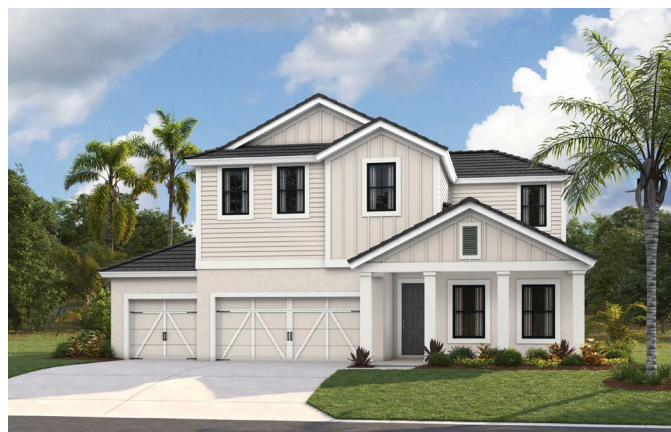
Modern Farmhouse | MFH3