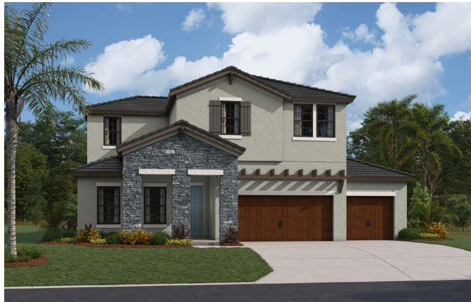
Tuscan A | TUS9

3,554 Square Feet | 5-6 Bedrooms 4 Baths | 3-Car Garage