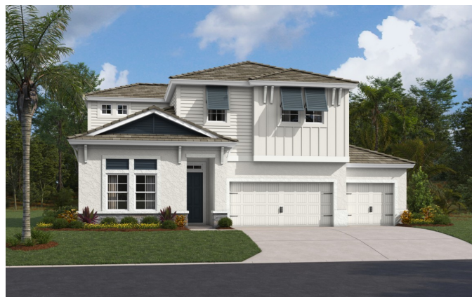
Coastal C | COA1