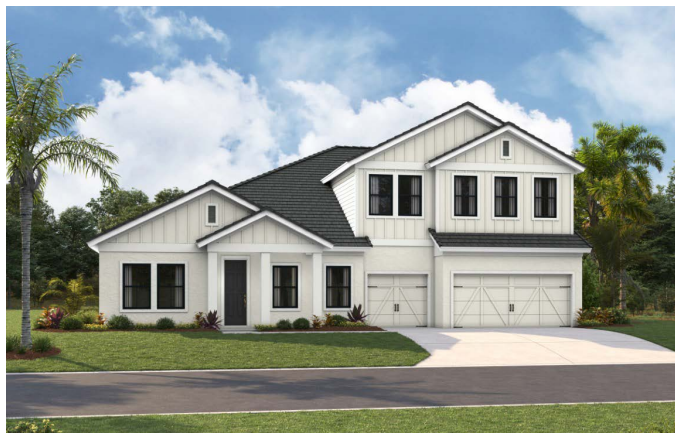
Modern Farmhouse | MFH6