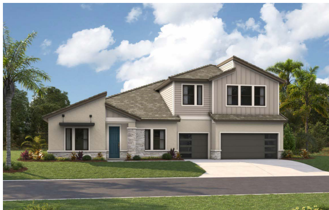
Modern | MOD3