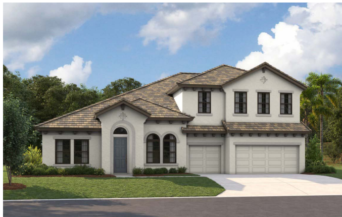
Mediterranean A | FMD12