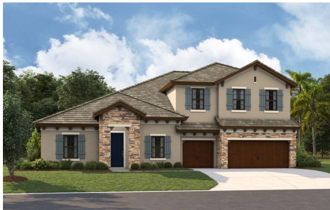
Tuscan A | TUS5