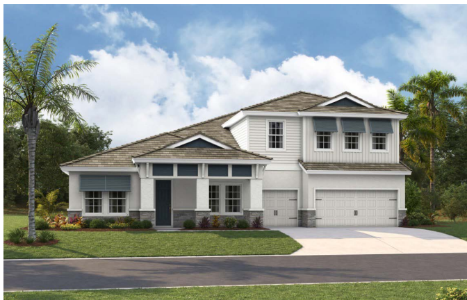
Coastal C | COA1