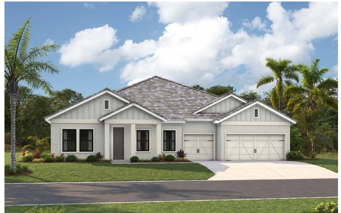
Modern Farmhouse | MFH7