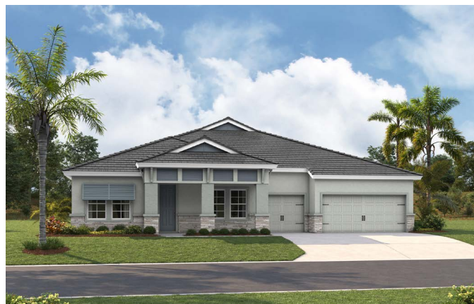
Coastal C | COA4