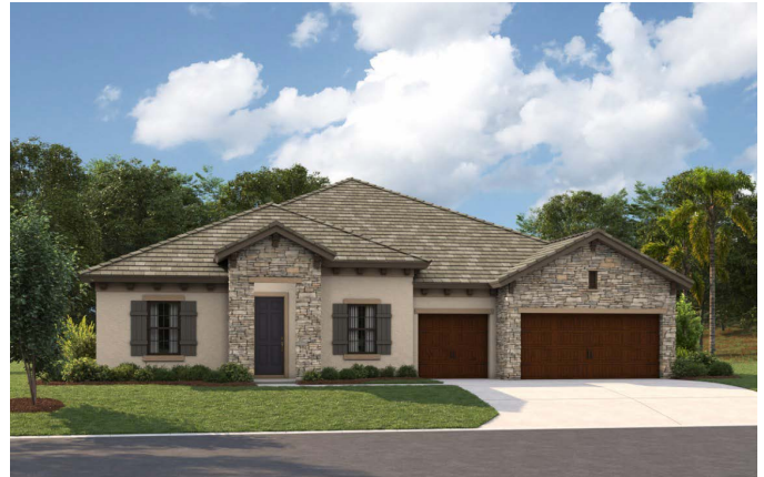
Tuscan A | TUS4