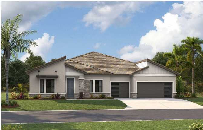
Modern | MOD8