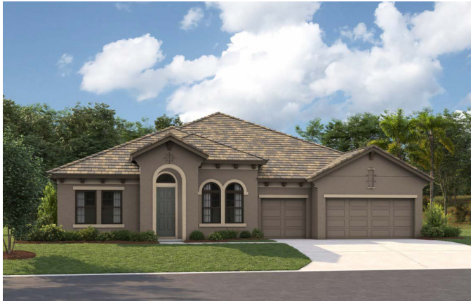
Mediterranean A | FMD12