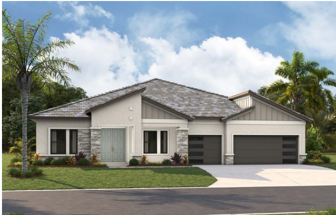
Modern | MOD6