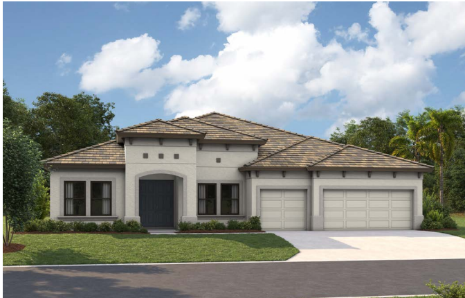
Mediterranean A | FMD14