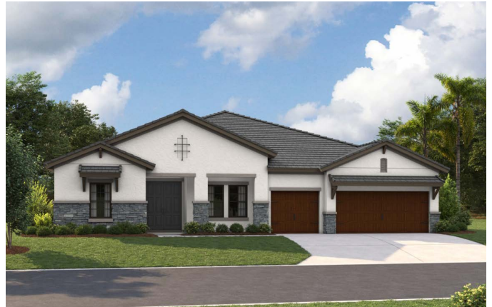
Tuscan A | TUS7