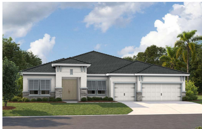
Coastal C | COA3