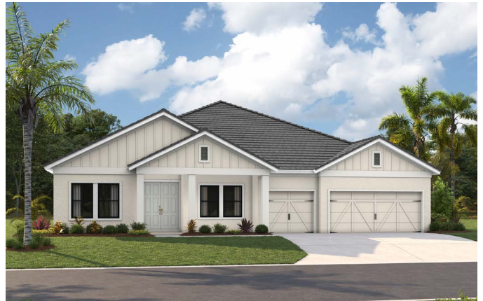
Modern Farmhouse | MFH1