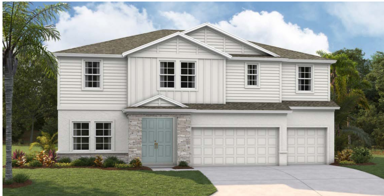
Coastal B | COA12