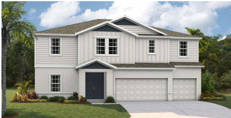
Coastal A | COA12

3,547 Square Feet | 5-6 Bedrooms 4 Baths | 3-Car Garage