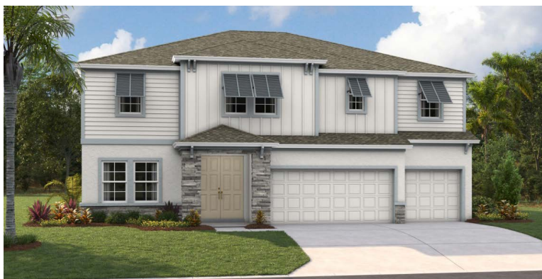
Coastal C | COA12