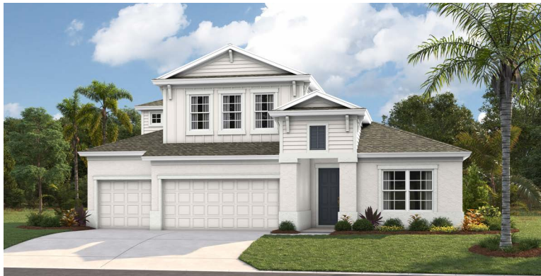
Coastal A | COA10

3,151 Square Feet | 4-5 Bedrooms 4 Baths | 3-Car Garage