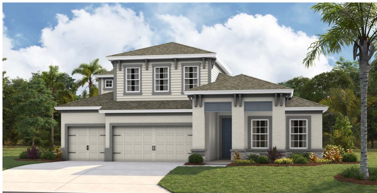
Coastal B | COA11