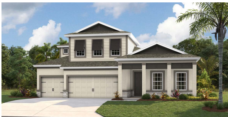
Coastal C | COA12