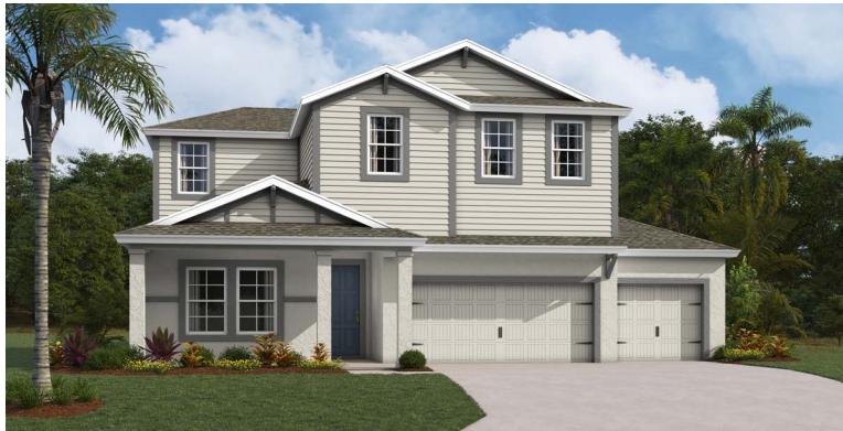
Coastal B | COA11