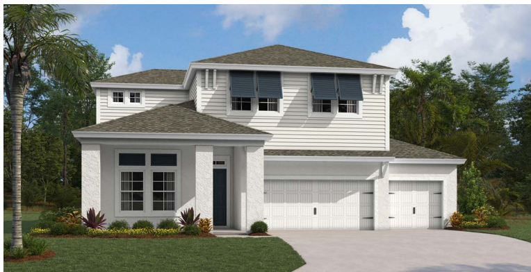
Coastal C | COA1