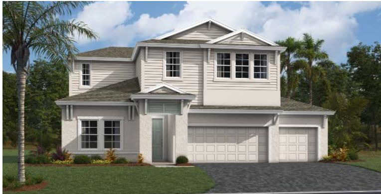
Coastal A | COA6