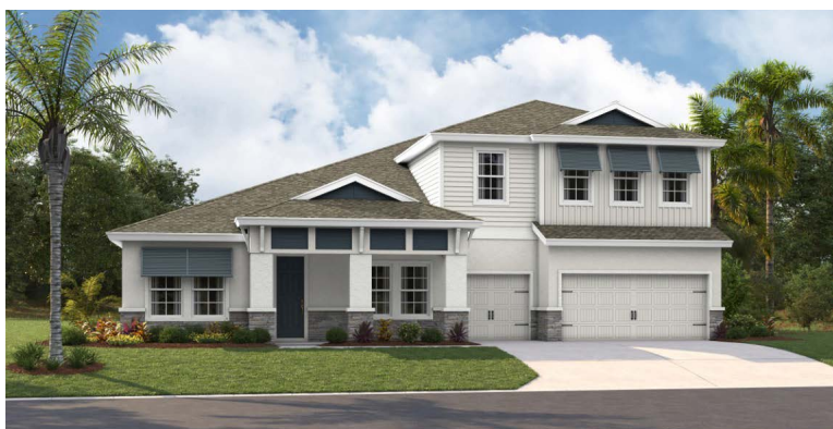
Coastal C | COA1