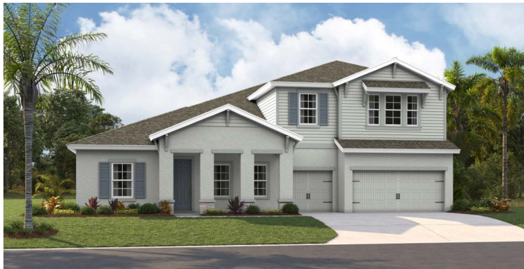
Coastal B | COA4