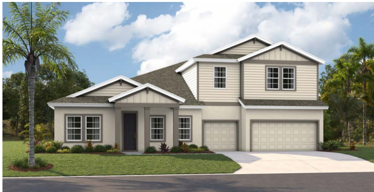
Coastal A | COA12