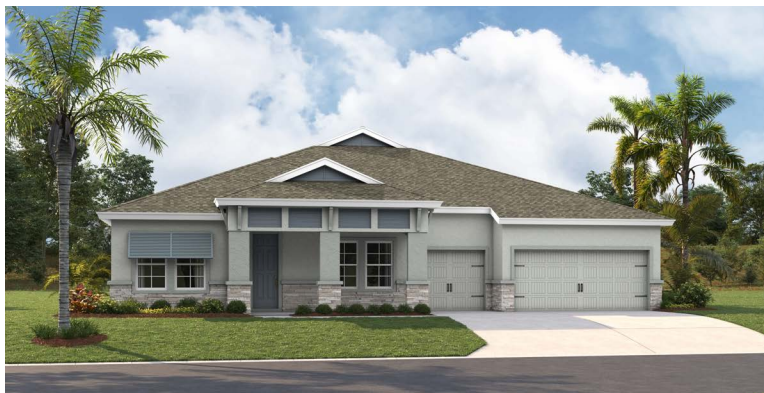
Coastal C | COA4