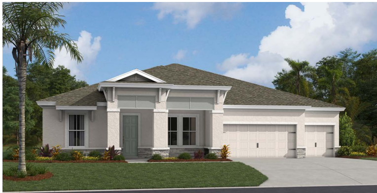
Coastal C | COA12