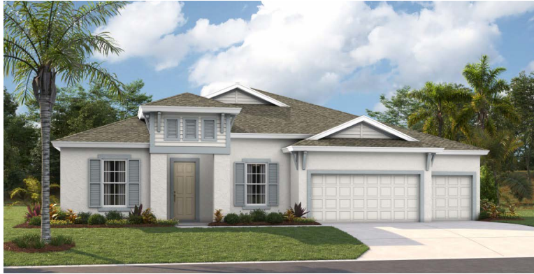
Coastal A | COA1