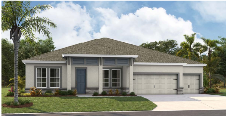
Coastal B | COA7