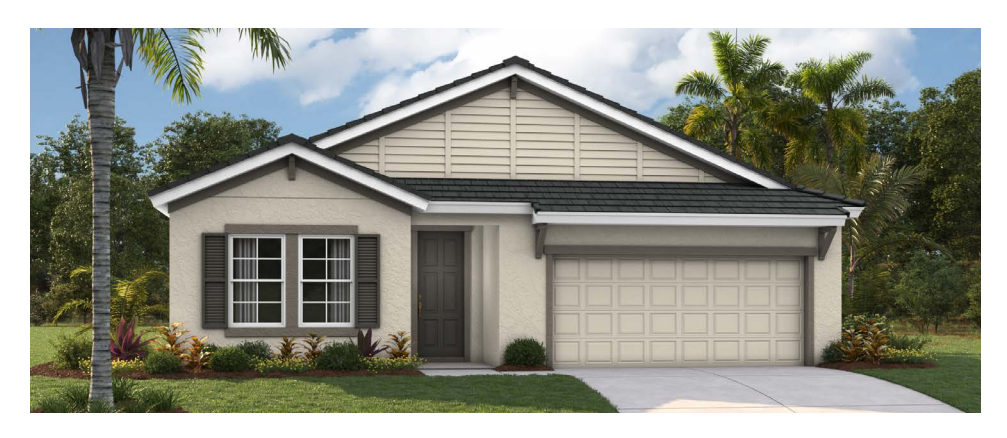
Coastal D | COA12