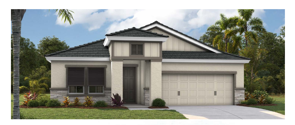
Coastal F | COA12