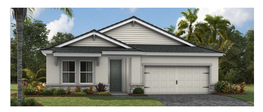
Coastal E | COA5