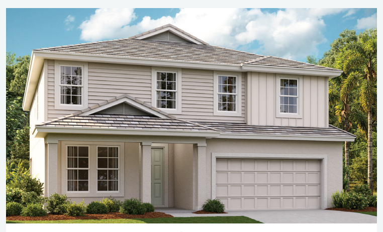
Coastal A | COA6