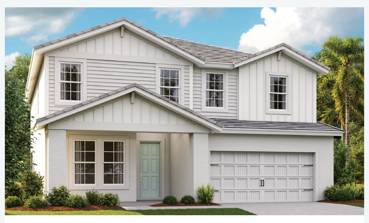
Coastal B | COA2