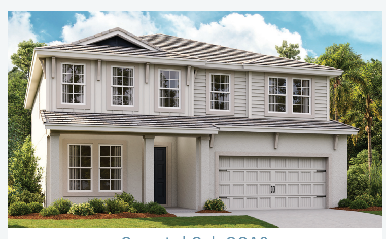
Coastal C | COA9