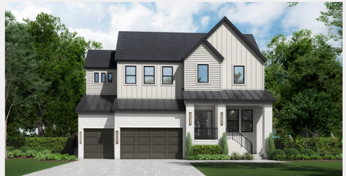
Modern Farmhouse | Tucked Stairs