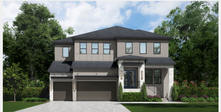
Contemporary | Tucked Stairs