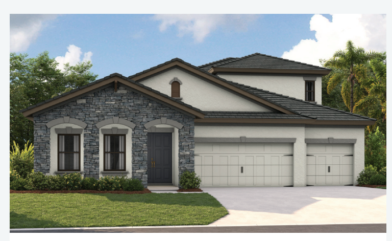
European | EUC9