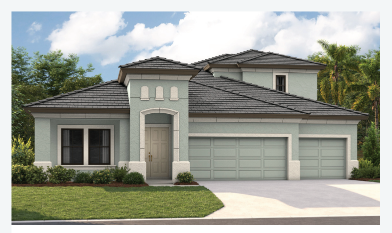
Mediterranean | FMD11