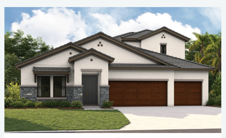
Tuscan | TUS7