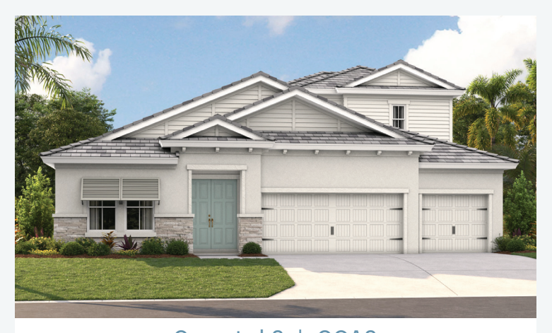
Coastal 2 | COA2