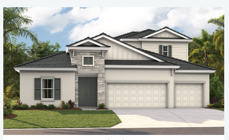
Coastal 1 | COA5