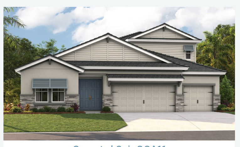
Coastal 3 | COA11