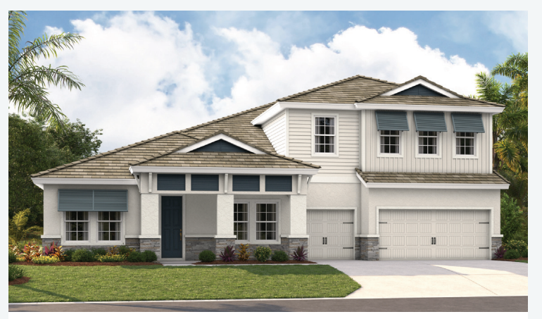
Coastal C | COA1