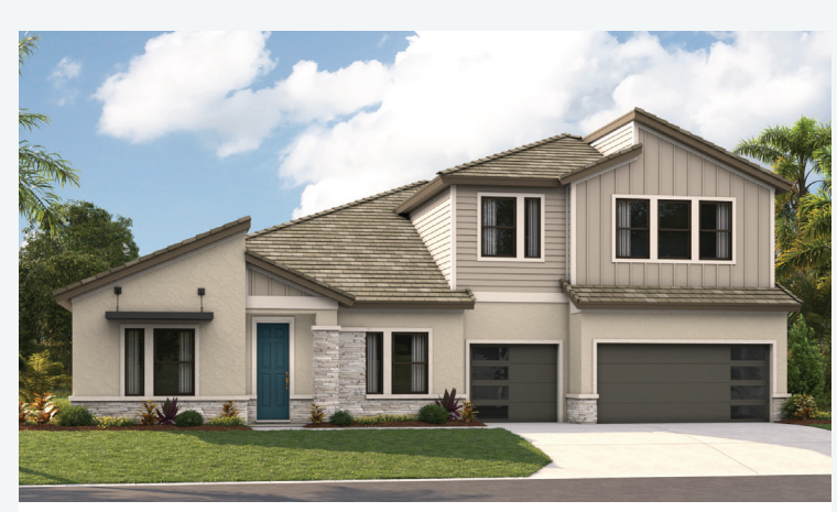
Modern | MOD3