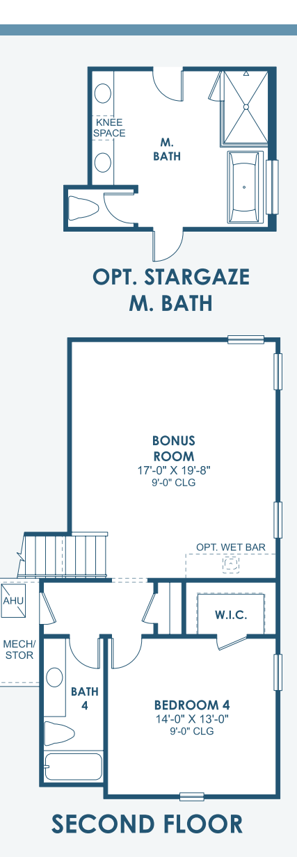
*FRONT WINDOWS, ENTRY/PORCHES AND ROOM DIMENSIONS MAY VARY PER ELEVATION* *REFERENCE MASTER PLAN SETS FOR ACTUAL SQUARE FOOTAGE TOTALS AND ENTRY LAYOUTS*