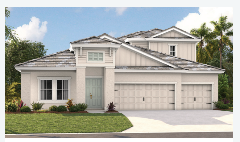
Coastal B | COA6