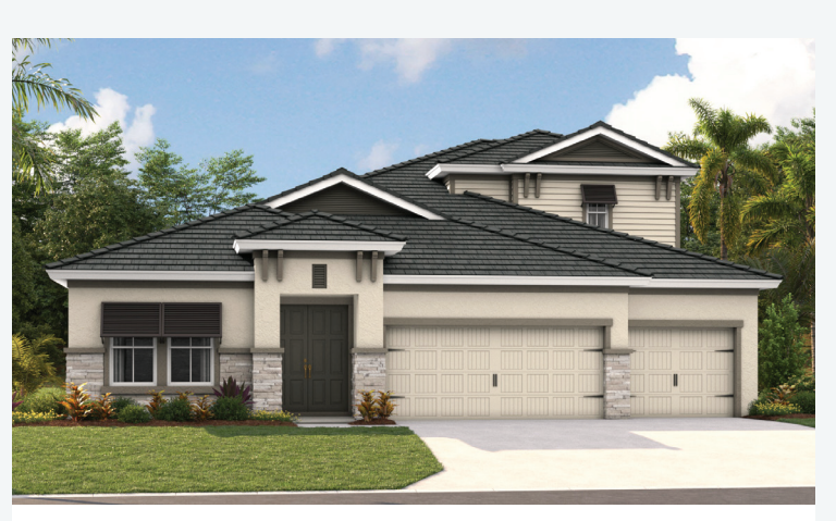
Coastal C | COA12