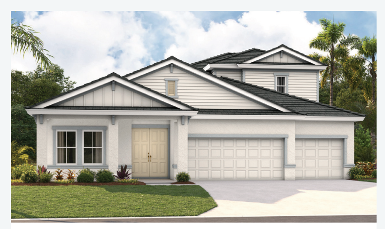
Coastal A | COA3