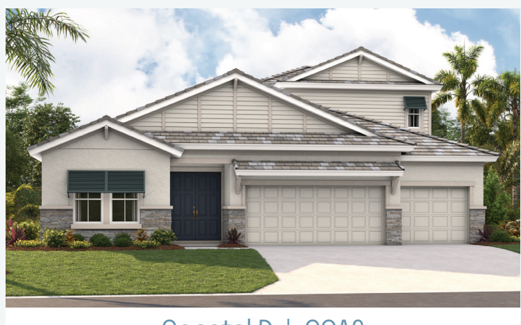
Coastal D | COA9