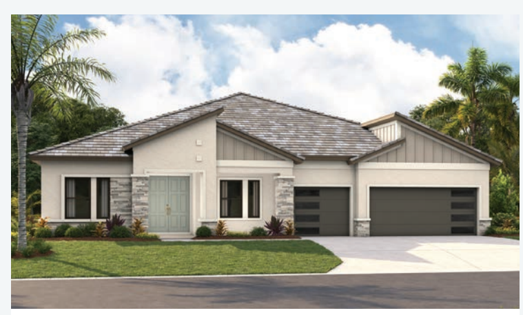
Modern | MOD6