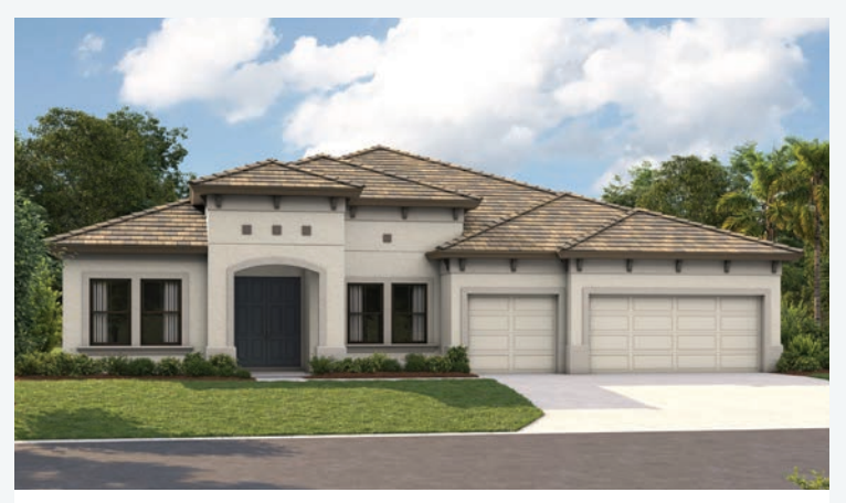
Mediterranean | FMD14

2,903-3,276 Sq.Ft. | 3-4 Bedrooms 3 Baths | 3-Car Garage