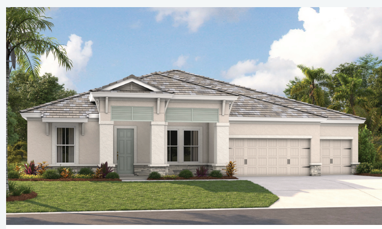
Coastal C | COA6