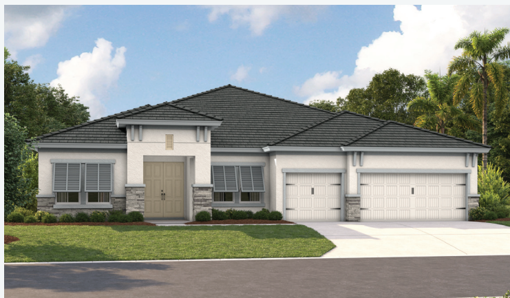
Coastal C | COA3