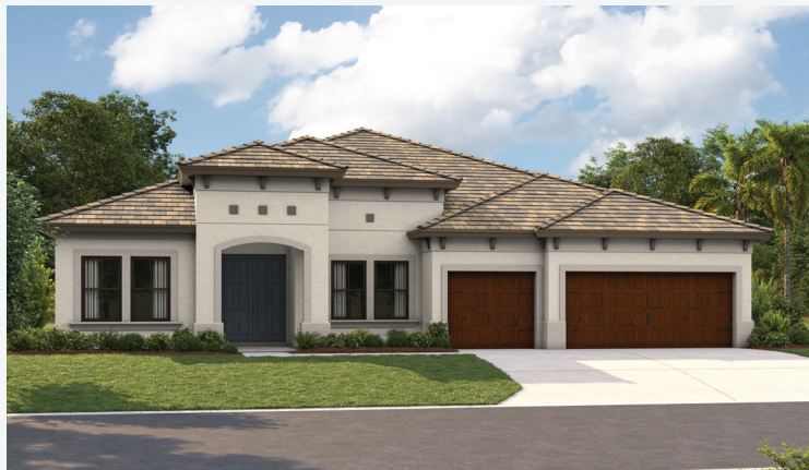
Mediterranean | FMD14

2,903-3,276 Sq.Ft. | 3-4 Bedrooms 3 Baths | 3-Car Garage