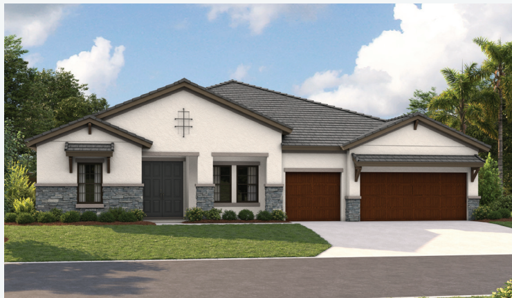
Tuscan | TUS7