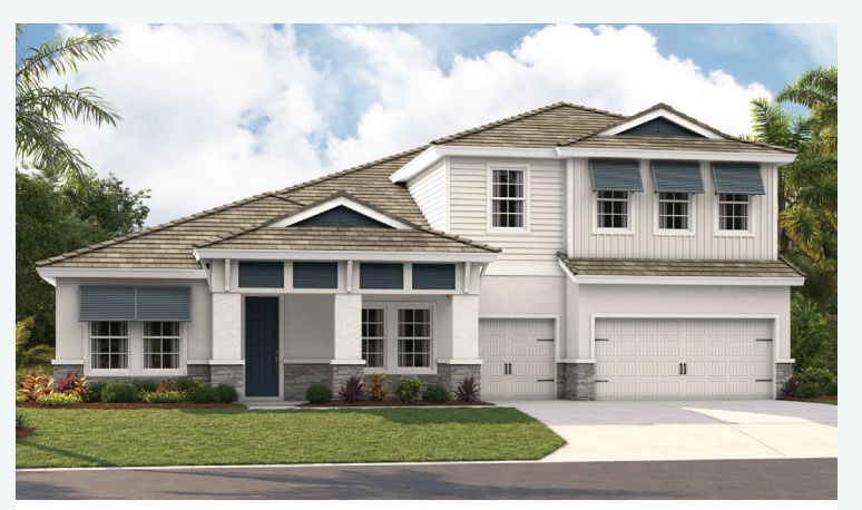
Coastal C | COA1