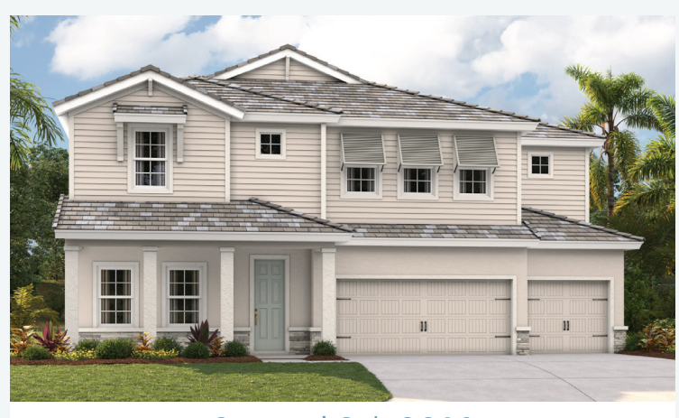
Coastal C | COA6