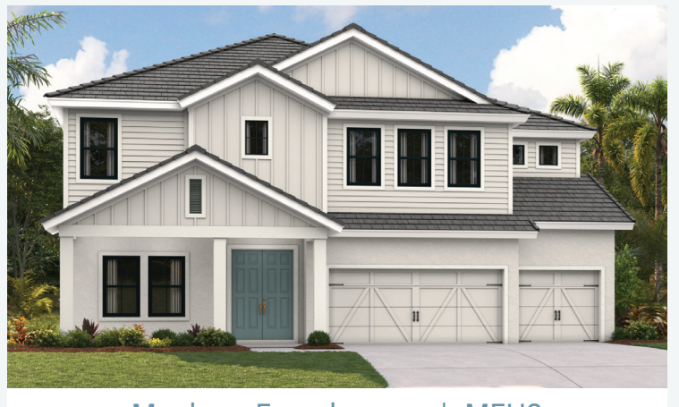
Modern Farmhouse | MFH2