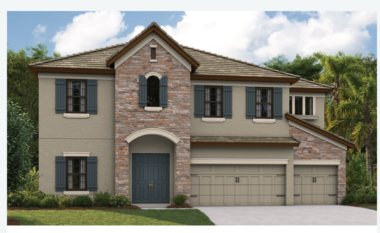
European Country | EUC1