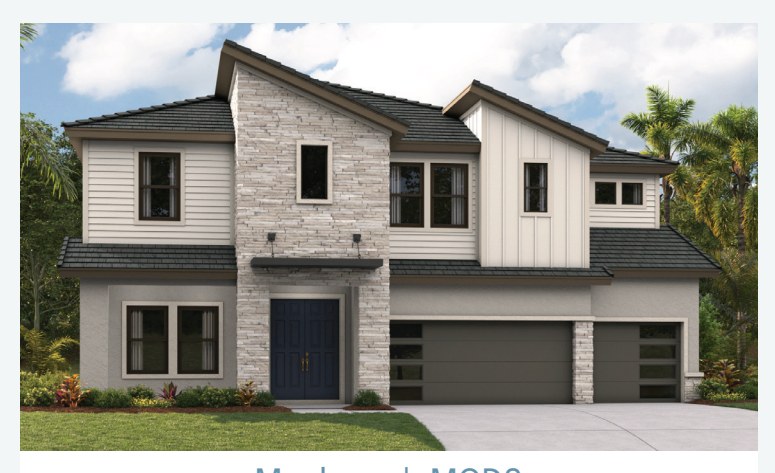
Modern | MOD2