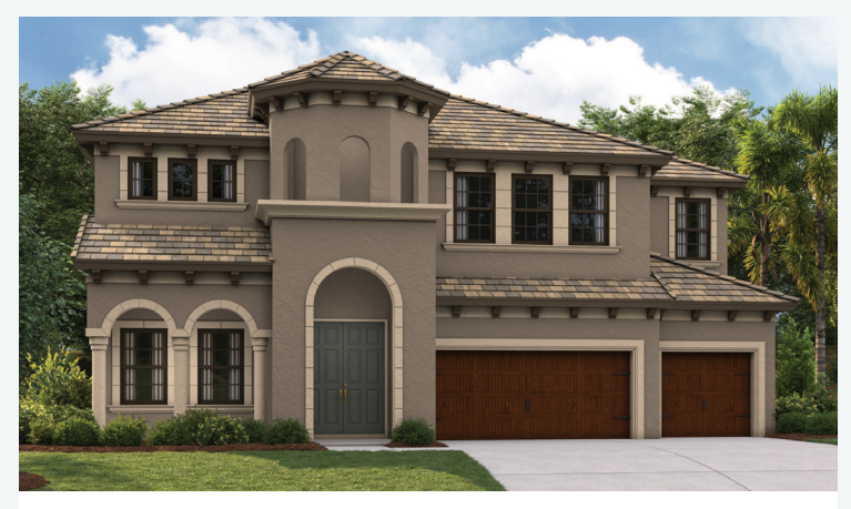
Mediterranean | FMD2