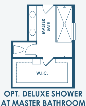
*FRONT WINDOWS, ENTRY/PORCHES AND ROOM DIMENSIONS MAY VARY PER ELEVATION* *REFERENCE MASTER PLAN SETS FOR ACTUAL SQUARE FOOTAGE TOTALS AND ENTRY LAYOUTS* rendering. Actual construction may vary in color, features and dimensions. Availation are subject to change without notice. All plans require developer approvements with those developer requirements. Planse peak with a Homes by West