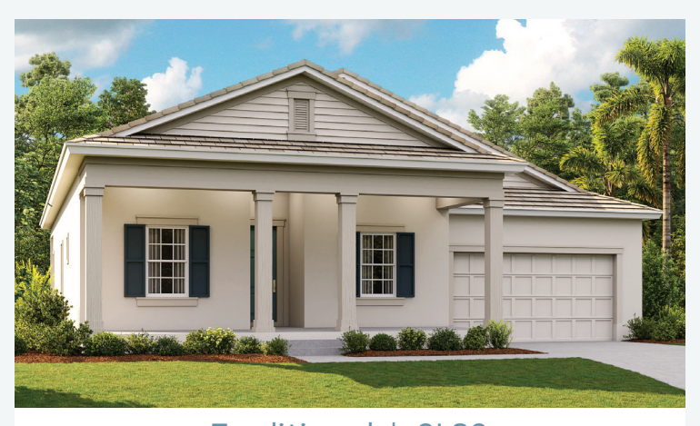
Traditional | CLS8