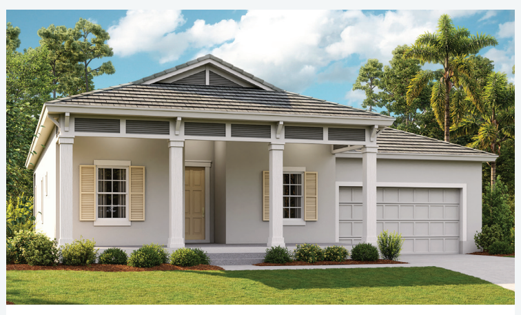
Coastal | COA3