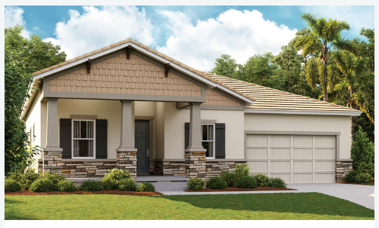
Craftsman | CRT10