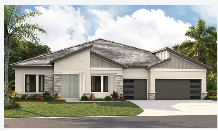
Modern | MOD6