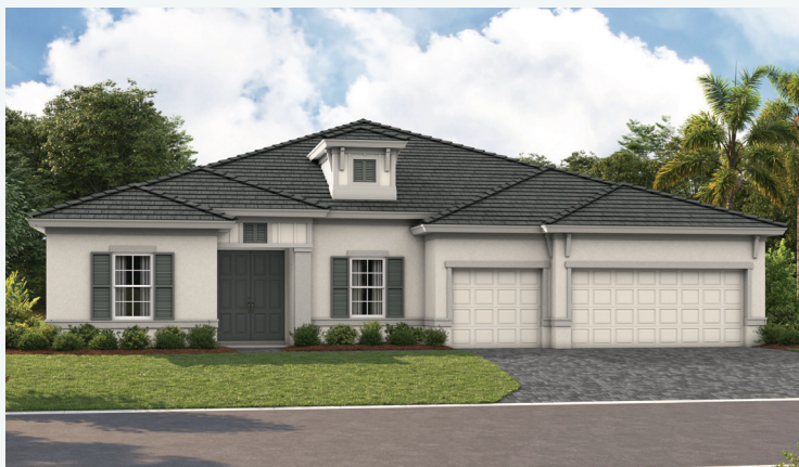
Coastal D | COA5

2,903-3,276 Sq.Ft. | 3-4 Bedrooms 3 Baths | 3-Car Garage