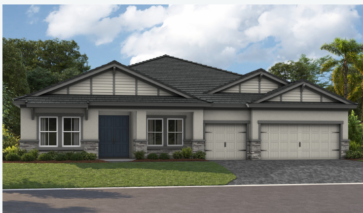
Coastal E | COA11