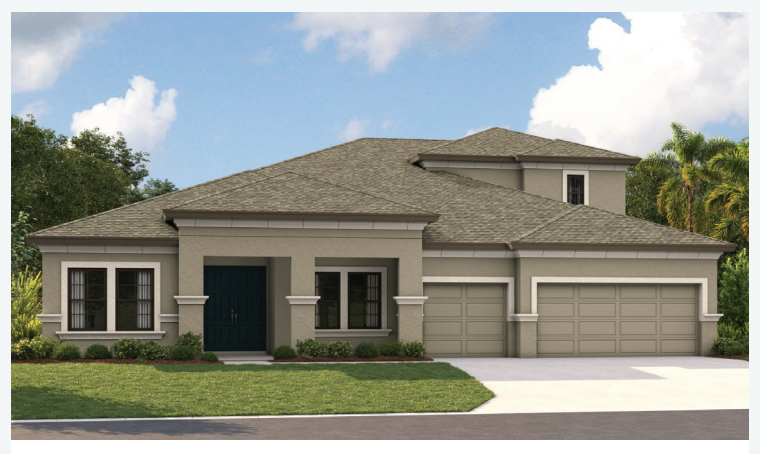
Mediterranean B | FMD13