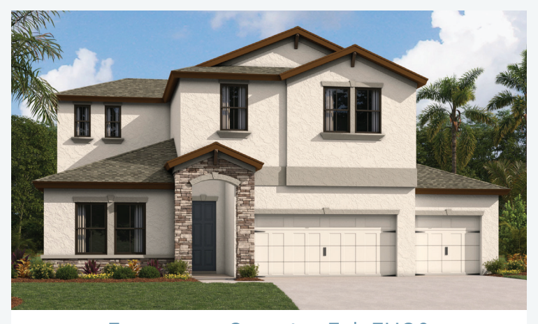
European Country F | EUC6