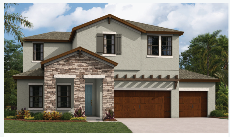
Tuscan D | TUS9