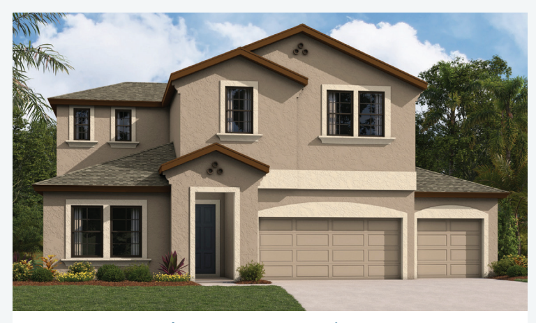
Mediterranean E | FMD8