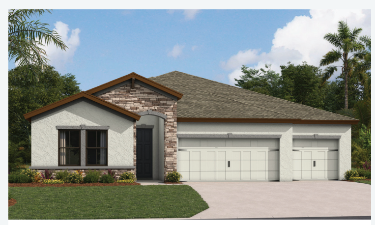
European Country F | EUC9