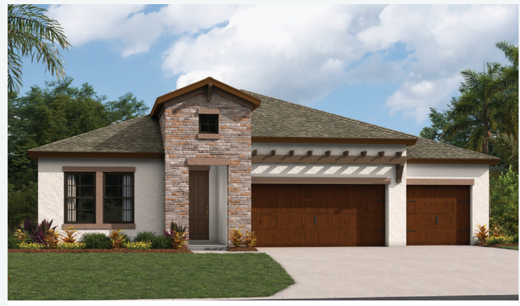
Tuscan D | TUS1