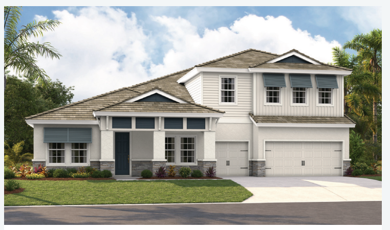
Coastal C | COA1