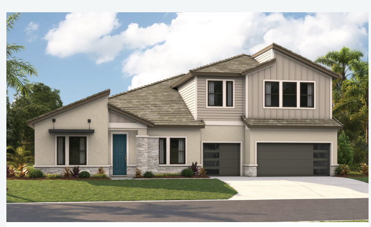
Modern | MOD3