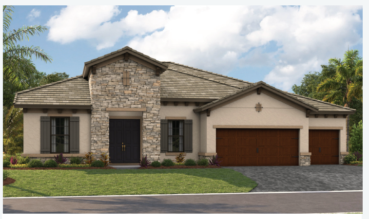
Tuscan | TUS4