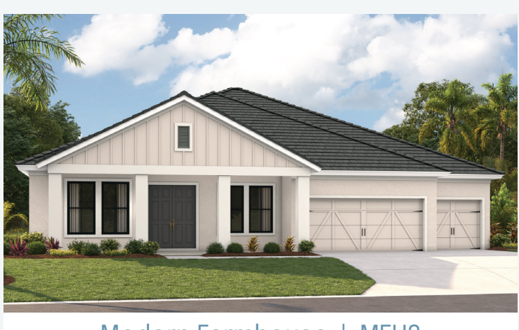
Modern Farmhouse | MFH3