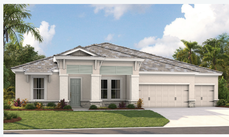
Coastal C | COA6