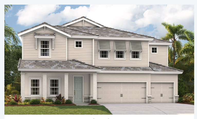
Coastal C | COA6