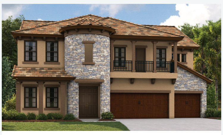
Tuscan | TUS2