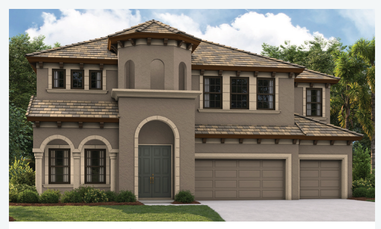
Mediterranean | FMD2