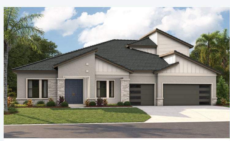
Modern | MOD2