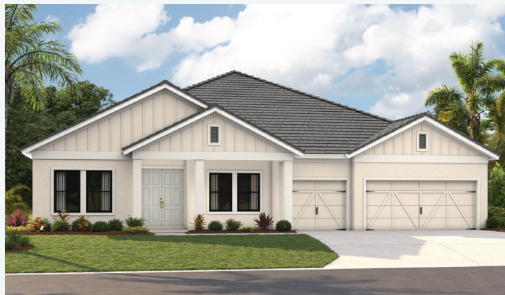
Modern Farmhouse | MFH1