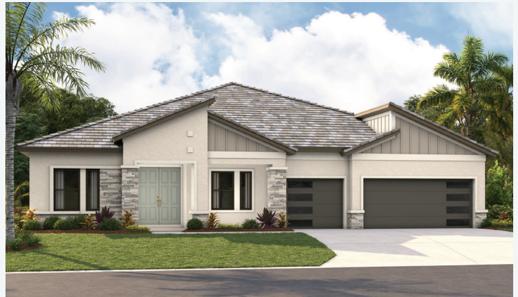
Modern | MOD6