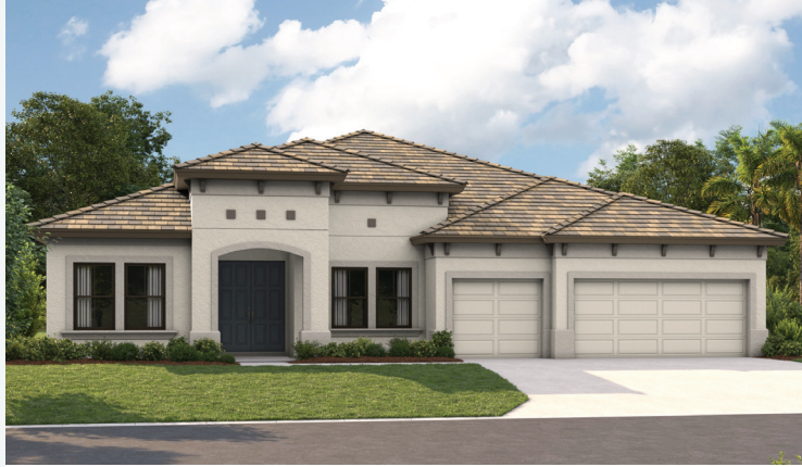
Mediterranean A | FMD14

2,903-3,276 Sq.Ft. | 3-4 Bedrooms 3 Baths | 3-Car Garage