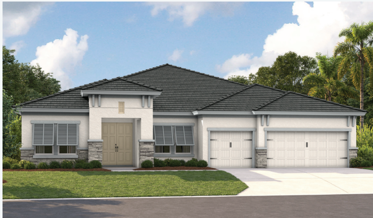
Coastal C | COA3