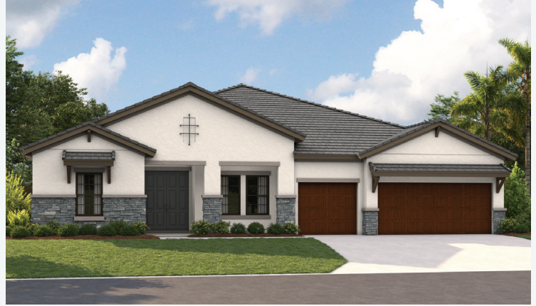
Tuscan | TUS7