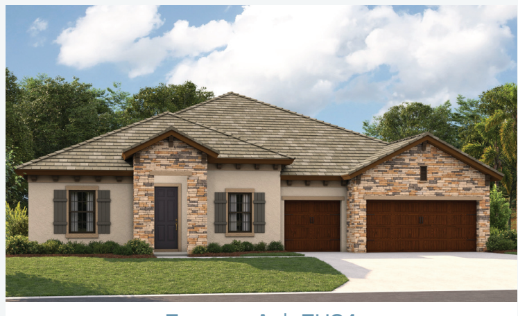
Tuscan A | TUS4