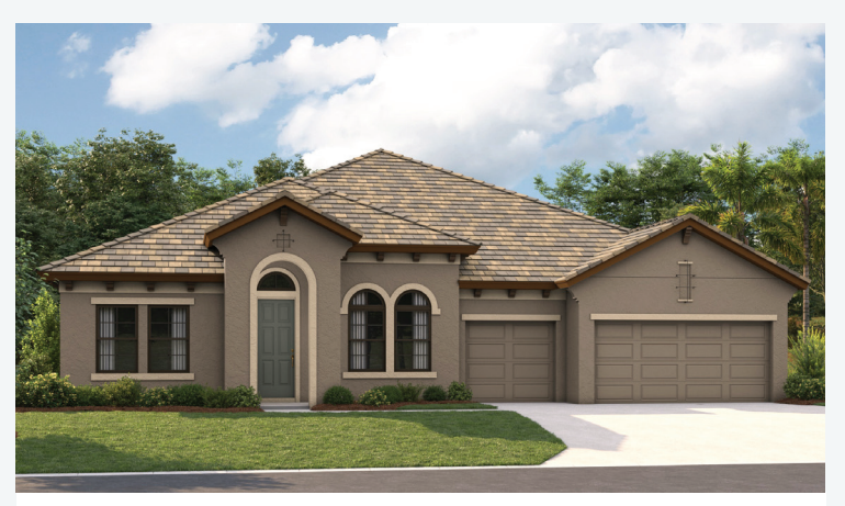
Mediterranean A | FMD2