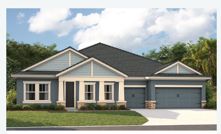
Craftsman A | CRT4