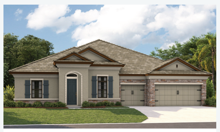
European A | EUC1