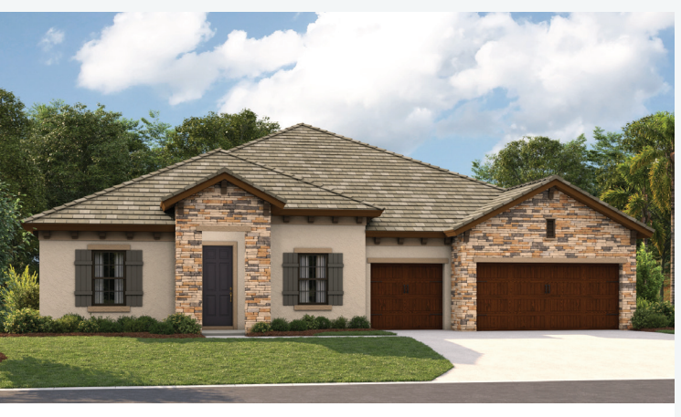
Tuscan A | TUS4