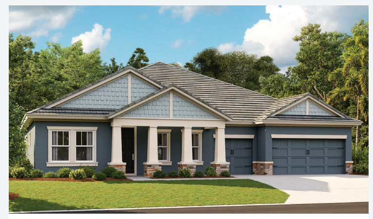
Craftsman A | CRT4