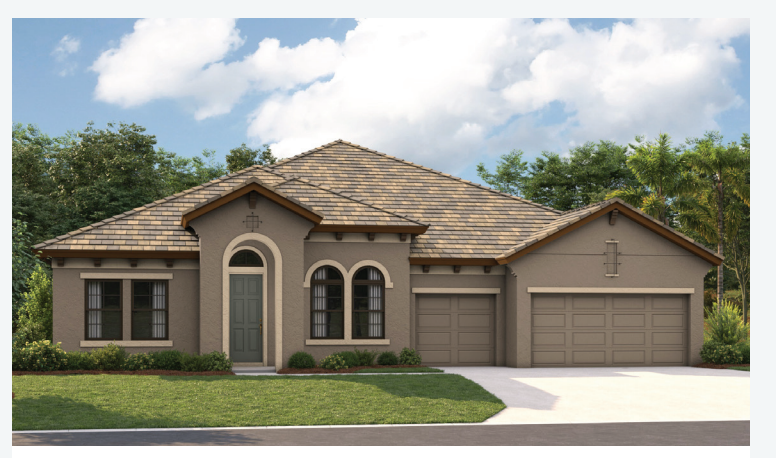
Mediterranean A | FMD2