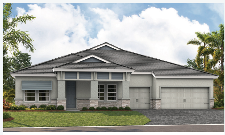
Coastal C | COA4