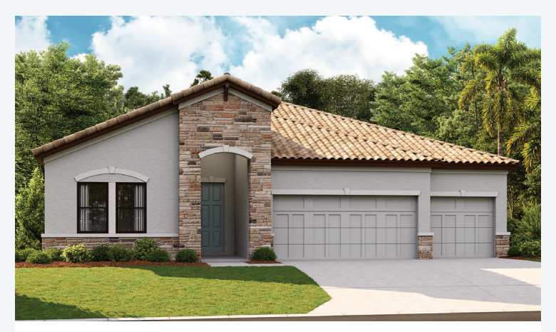
European A | EUC7