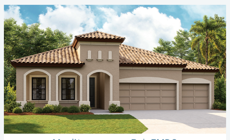
Mediterranean B | FMD8