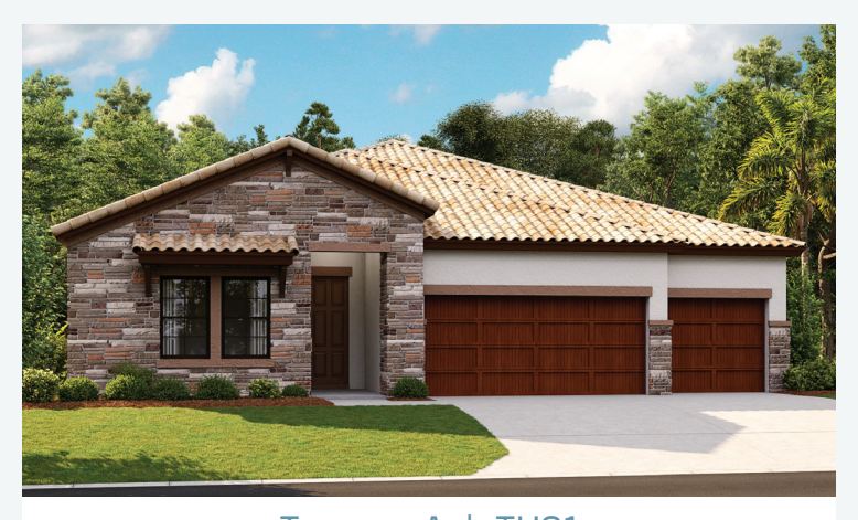
Tuscan A | TUS1