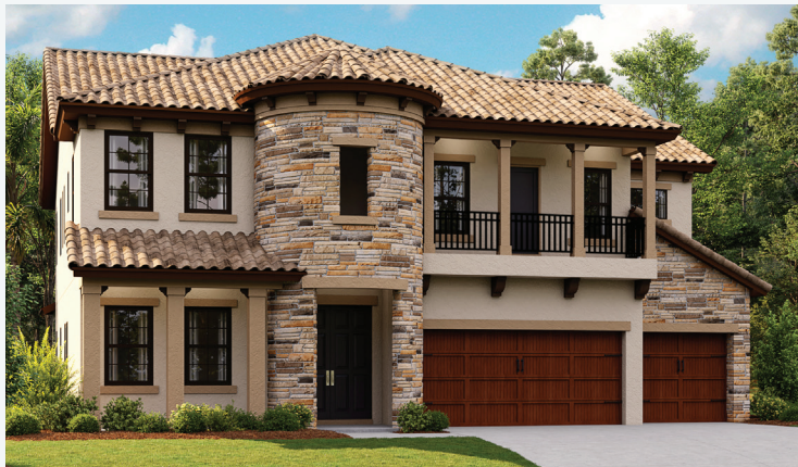
Tuscan A | TUS4