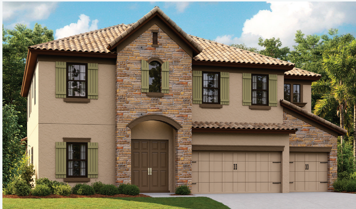
European A | EUC4