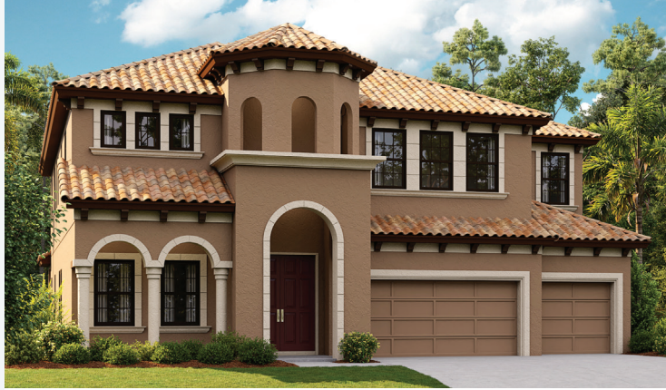
Mediterranean A | FMD5

4,828-4,900 Sq.Ft. | 5 Bedrooms 4-6 Baths | 3-Car Garage