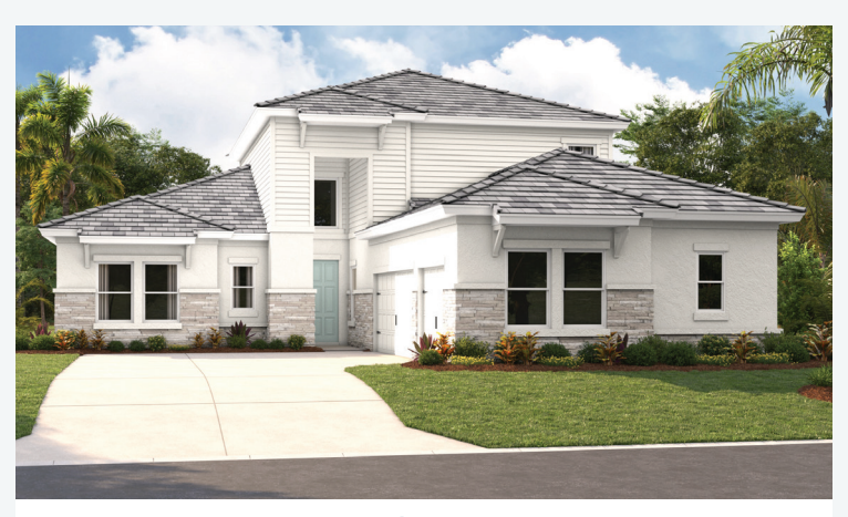
Coastal B | COA2