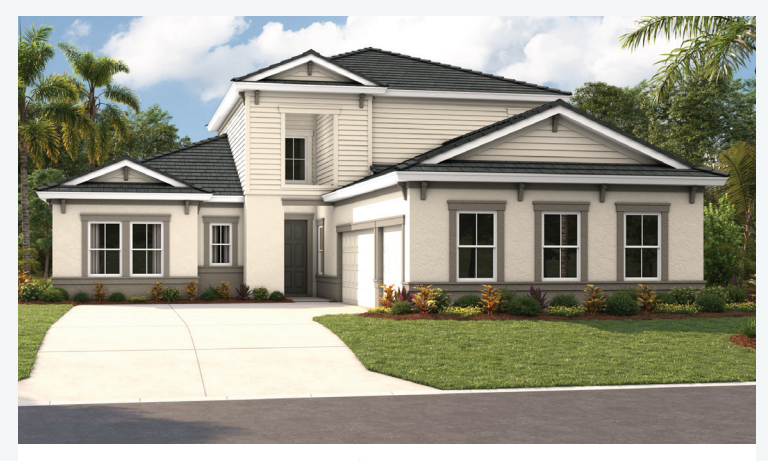
Coastal A | COA12