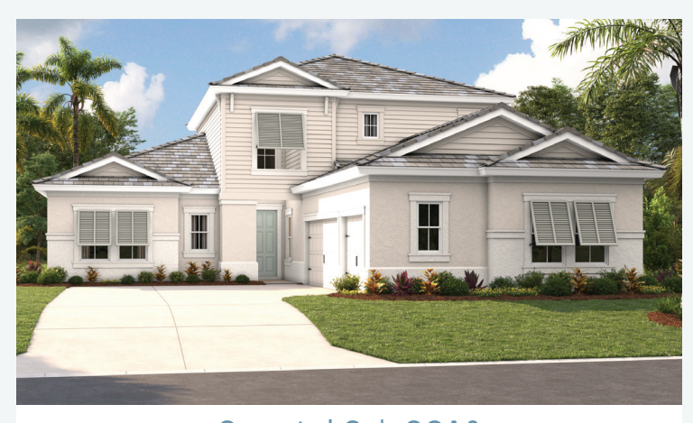
Coastal C | COA6