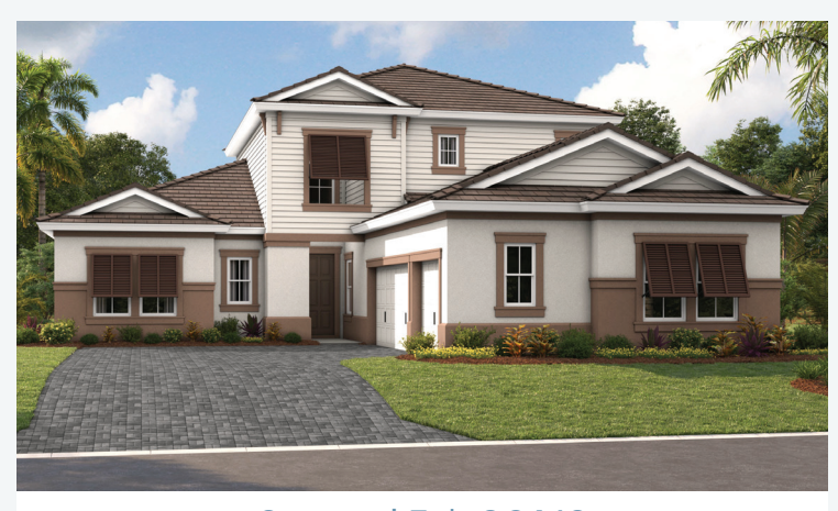
Coastal F | COA13