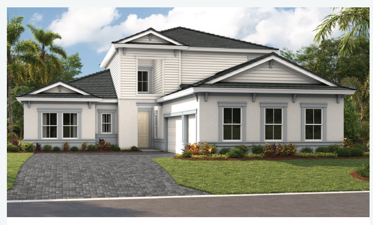
Coastal D | COA3