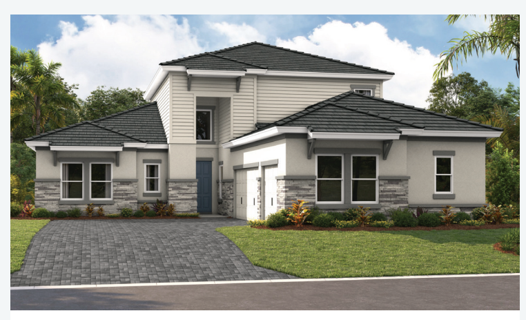
Coastal E | COA11