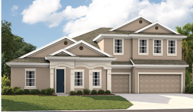
Classical B | CLS3

4,250-4,619 Sq.Ft. | 4-6 Bedrooms 3-5 Baths | 3-Car Garage