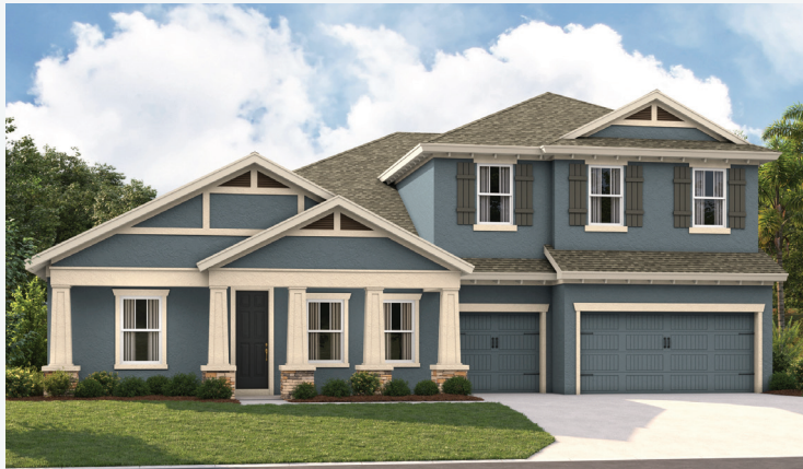
Craftsman B | CRT4