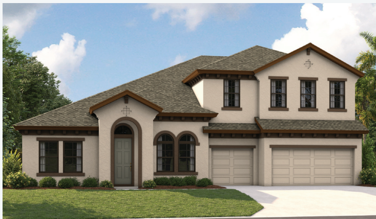
Mediterranean B | FMD6