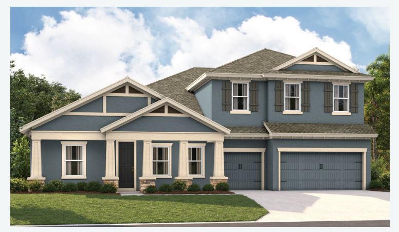
Craftsman B | CRT4