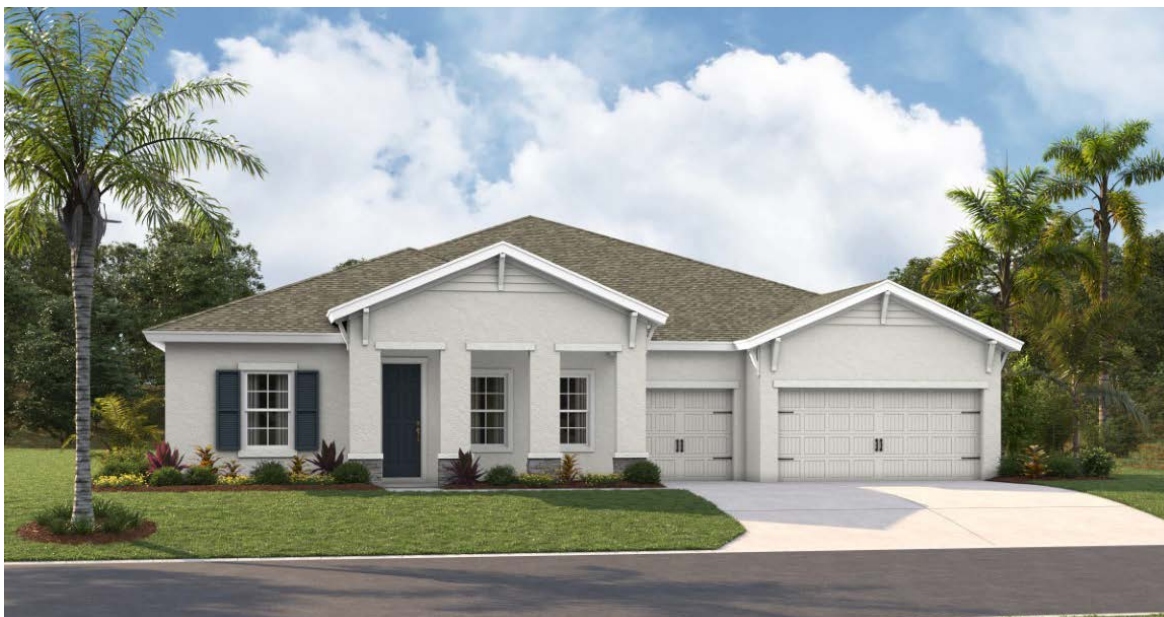
Coastal B | COA1 Color Scheme