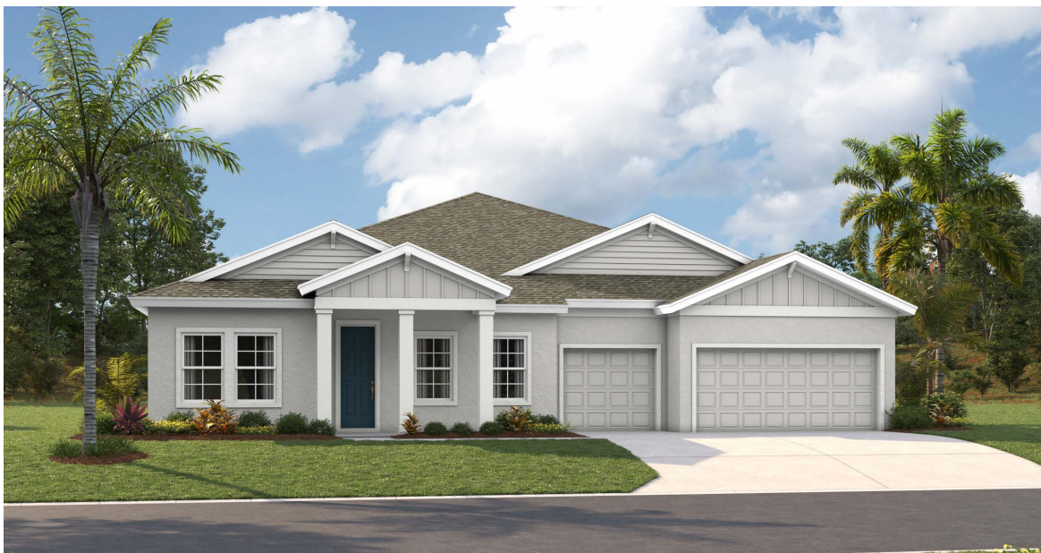
Coastal A | COA7 Color Scheme