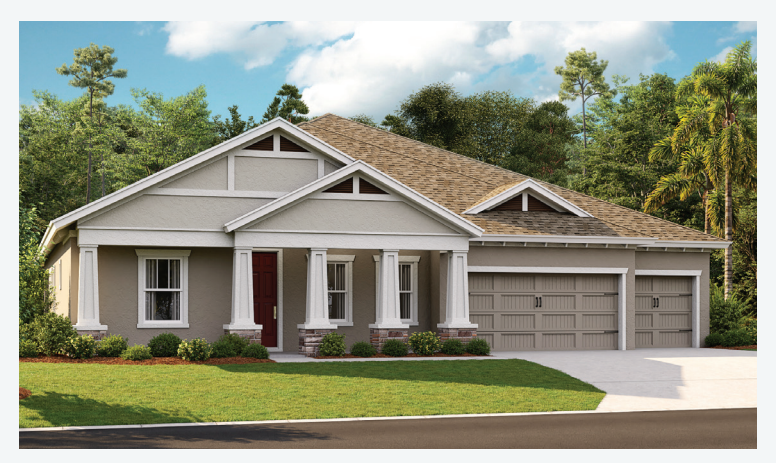
Craftsman B | CRT2