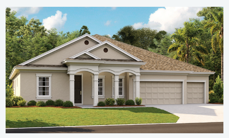
Classical B | CLS2