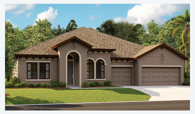
Mediterranean B | FMD2