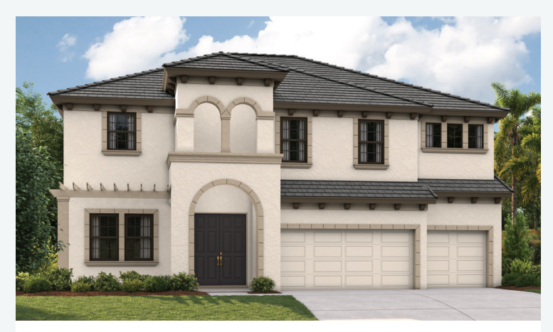
Mediterranean A | FMD3