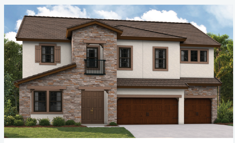
Tuscan A | TUS1