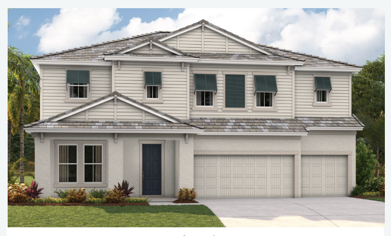
Coastal C | COA9