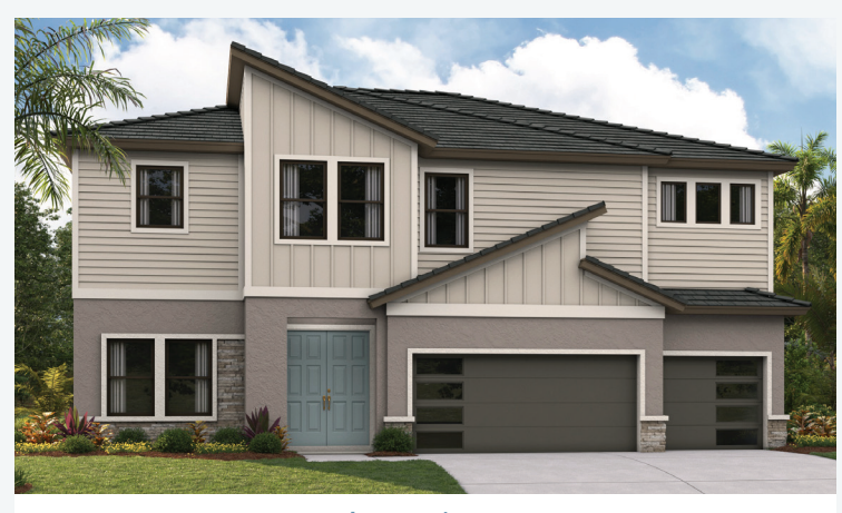
Modern | MOD9