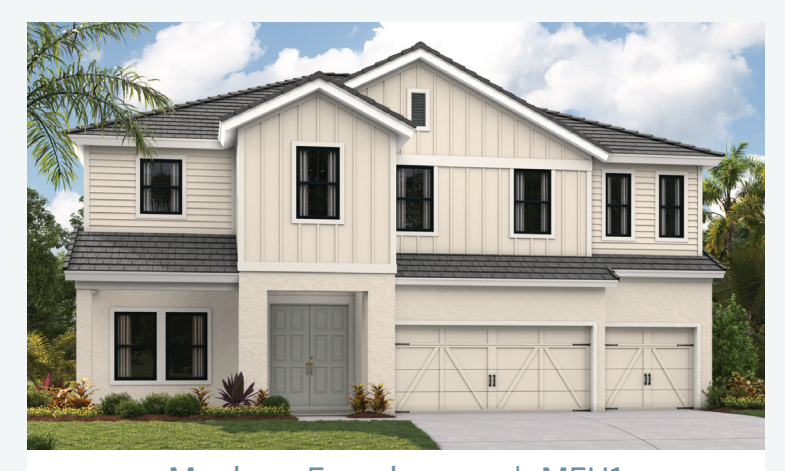
Modern Farmhouse | MFH1